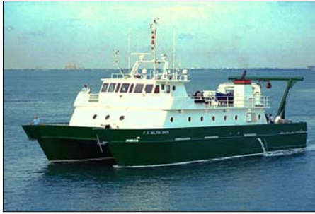
Surface drifter deployments are made from the University of Miami's research vessel F.G. Walton Smith .

Keys coral reef tract. The Tortugas Gyre, generally located to the south of the Dry Tortugas along the inshore front of the Loop Current, tends to form periodically over a period of weeks to months and then slowly drifts through the region until it is absorbed by the Florida Current offshore of the Florida Keys. The trajectory shown on the previous page is of a surface drifter deployed in the Dry Tortugas in August 2002. This drifter meandered slowly to the northwest until it was entrained along the edge of the Loop Current, made one revolution around the Tortugas Gyre, and then exited the area via the Florida Current.