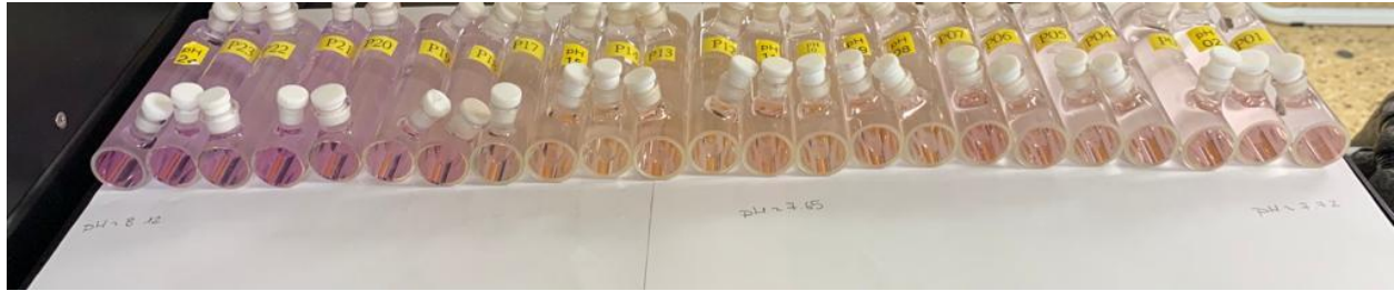
Figure 2: pH samples collected at station 98 (23.183°N, 90.642°W) from surface (left) to bottom (right).

As we expected, we have noticed a significant increase in surface carbon concentrations as we moved into the warmer Bay of Campeche (Figure 3). Except for the low values that were measured in the Mississippi region, surface carbon concentrations in the GOM are well above 400 ppm in general. In the west Yucatan shelf values are upwards of 450 ppm. Please note that these are preliminary data that still need to be calibrated and quality controlled, but the variability and ballpark numbers should stay fairly consistent.