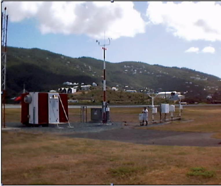
FIG. 4. Assessing roughness is not valid in locations where upstream fetches are influenced by complex terrain, for example, northward-looking fetch from the St. Thomas, U.S. Virgin Islands ASOS (KSTT).

tions ( 33.0 \text{ m s}^{-1} ) might be experienced nearby in locations with open exposure, we used (1) and (2) to estimate what the instruments might measure in their actual exposures. The effect of the rougher exposures is to underestimate the unobstructed flow conditions by 30%–40%, hence it is important to correct poorly exposed measurements. It is important to note that the roughness assessments and correction methods described herein are not valid for upstream fetches influenced by complex terrain (Fig. 4), where the measurements are affected by local flow accelerations associated with hills and valleys (Miller and Davenport 1998; Powell and Houston 1998).