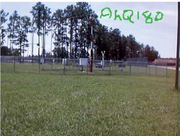
FIG. 3. Photo documentation of selected ASOS and C-MAN stations with estimates of exposure effects on an open-terrain, hurricane-force mean wind speed of 33.0 \text{ m s}^{-1} . Digital photos for ASOS stations were field annotated with station ID and compass heading. (a) Rough terrain ( \sim 0.4 \text{ m} roughness) exposure at Chatham, MA (CQX), looking north; estimated wind speed measurement for this exposure, 22.0 \text{ m s}^{-1} . (b) Open-terrain exposure ( \sim 0.03\text{-m} roughness) from Panama City, FL (PFN), looking northeast; estimated wind speed measurement for this exposure, 33.0 \text{ m s}^{-1} . (c) Moderately rough terrain exposure ( \sim 0.3\text{-m} roughness) from Panama City, FL (PFN), looking southwest; estimated wind speed measurement for this exposure, 23.4 \text{ m s}^{-1} . (d) Rough exposure ( \sim 0.4\text{-m} roughness) from Settlement Point, Grand Bahamas C-MAN station (SPGF1), looking south from anemometer; estimated wind speed measurement for this exposure, 22.0 \text{ m s}^{-1} . (e) Rough exposure ( \sim 0.6\text{-m} roughness) from Wakefield, VA (AKQ), looking south; estimated wind speed measurement for this exposure, 19.7 \text{ m s}^{-1} .