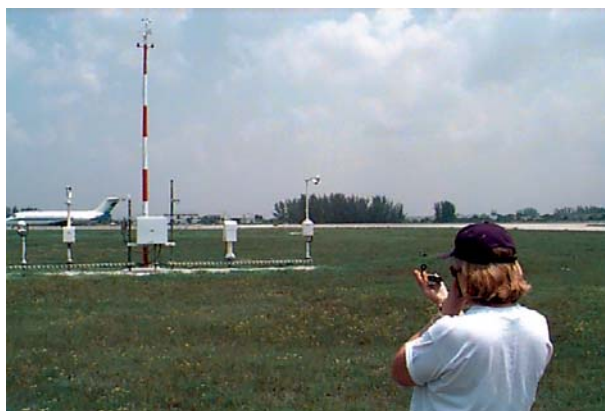
FIG. 1. Documentation of Opa Locka Airport (near Miami).

At the time of writing, 211 ASOS stations and 30 C-MAN stations have been photographically documented (Fig. 2). In addition to providing information on wind exposure, the photos allow NCDC to document types of temperature and precipitation sensors at each station. Operational forecasters may also benefit from the wind exposure documentation as it is sometimes difficult for forecasters to be familiar with the surroundings of ASOS and C-MAN stations they work with and validate against, within their county warning areas. The ASOS exposure documentation photos and other information could be linked to the local NWS Forecast Office Web page. If a forecaster sees