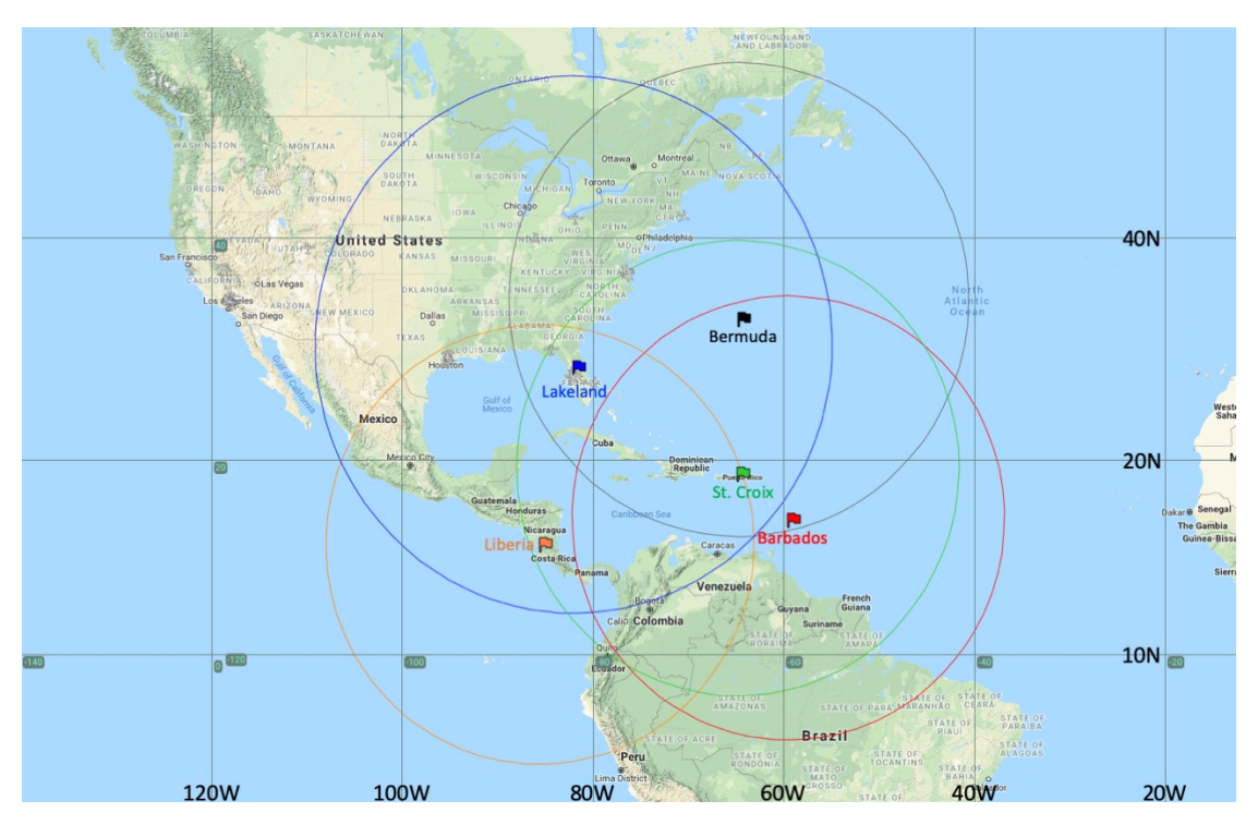
Figure D-2. Primary Atlantic operating bases and ranges (assuming \sim 2-h on-station time) for the G-IV