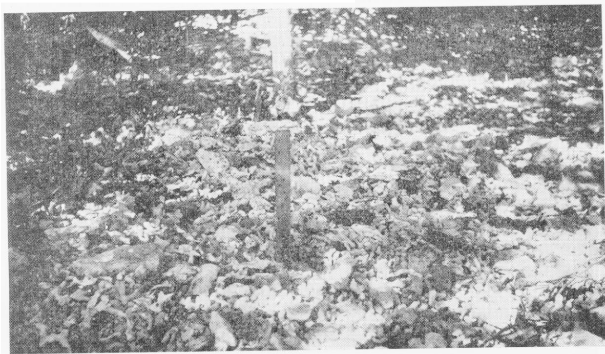
FIGURE 4. Floor of the mangrove-covered island at Cayo Laurel showing coral debris deposited to a depth of five inches (December 1, 1963). A 15-inch rule is shown embedded in the debris in the center of the field.

five inches. Where mangroves provided support, coral deposits reached a depth of 18 inches. Porites furcata contributed considerably to the debris deposited on all of the reef islets. Underlying the coral is a base layer of Halimeda opuntia which was located at the surface before the storm.