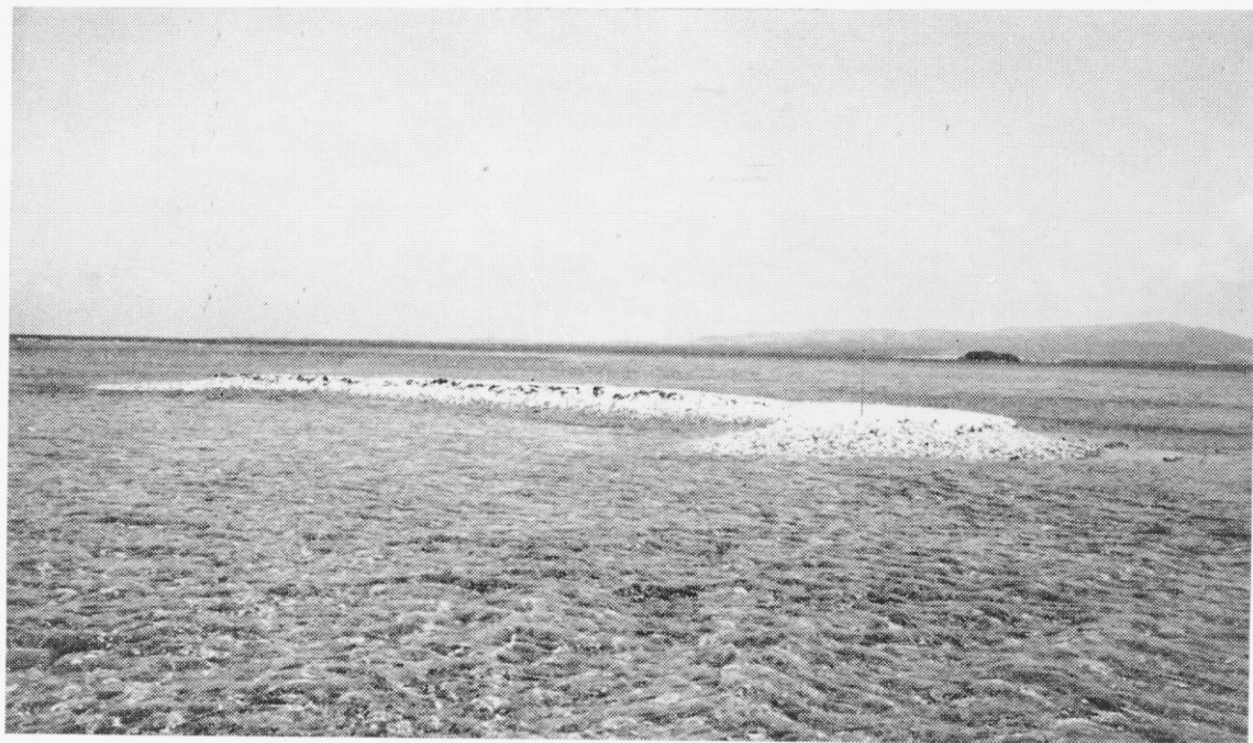
FIGURE 5. View toward the west of the new, crescent-shaped coral islet formed on Cayo Media Luna (March 19, 1964). A yardstick is shown embedded in the islet to the right.

In the fairly recent past, other devastating hurricanes that have certainly influenced the marine environment of the southwestern coast were San Ciriaco of 1898 and San Felipe of 1928. The frequency with which hurricanes may modify the environment of eastern America can be appreciated by the fact that a