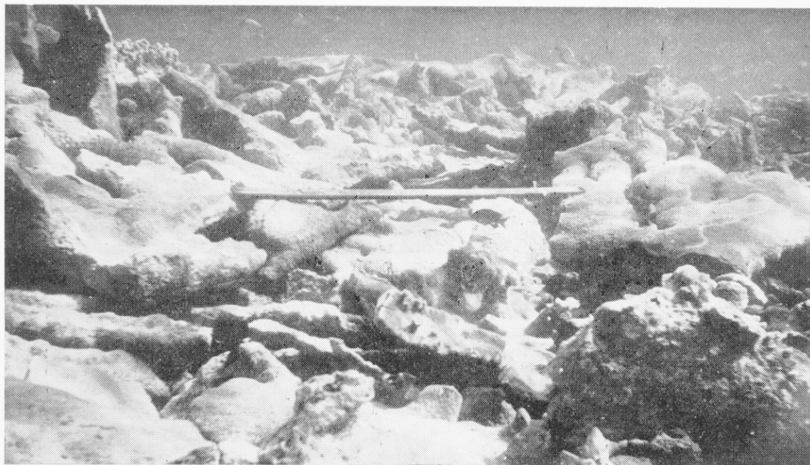
FIGURE 2. Underwater photograph showing complete destruction of Acropora palmata at a depth of about ten feet on the seaward edge at the eastern end of Cayo Laurel (January 31, 1964). A yardstick lies in a horizontal position near the center of the field.