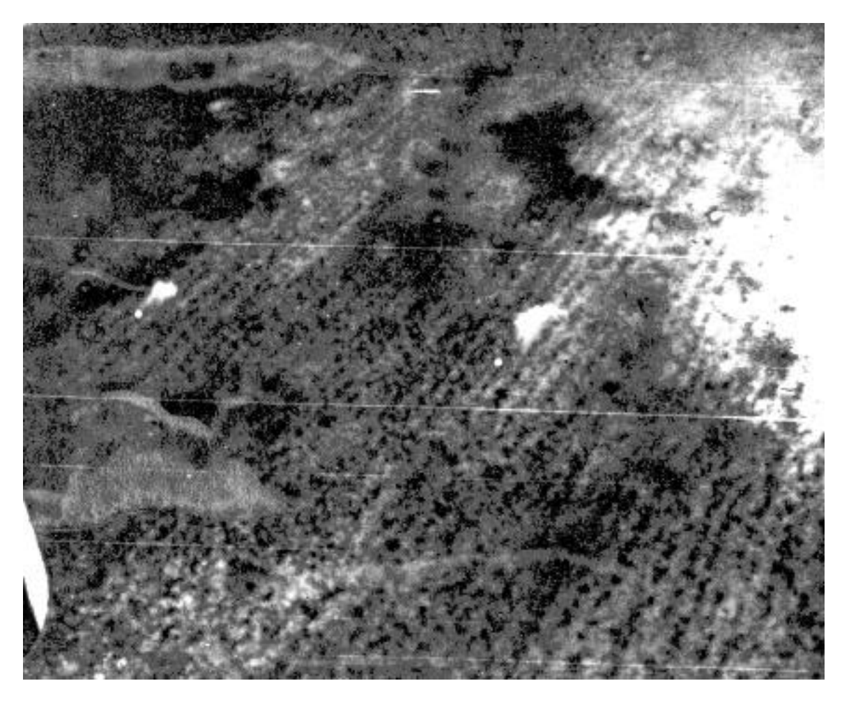
Figure 3. Parallel rows of Laurencia poitei in Card Sound indicating tidal current pattern. [SCANNED FROM A PHOTOCOPY OF THE ORIGINAL.]

Laurencia complexes and attached plants, the average plant weighed about 4 g. Total tip growth measurements were 1.66 cm (measured on 25 plants of 4 g) were 3.23 mg/day. Since the standing crop was 10.7 g/m² as a first approximation, the productivity of Laurencia poitei would then be 0.069 g (dry weight) /m²/day or 25.19 g/m²/year. Since Card Sound is approximately 37 km², this would make the annual productivity of Laurencia about 931 x 10^6 g dry weight in the total area.