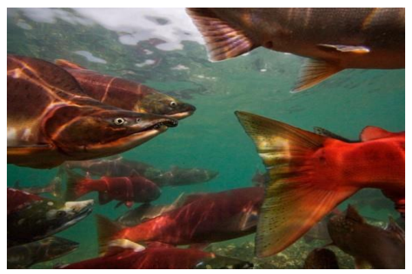
Volcano miracle Fraser River Sockeye of 2010

It is well known that dust in the wind powers ocean primary productivity by delivering vital mineral micronutrients. Mineral nutrients, i.e. dirt, are common on land but are the rarest of elements in the ocean.