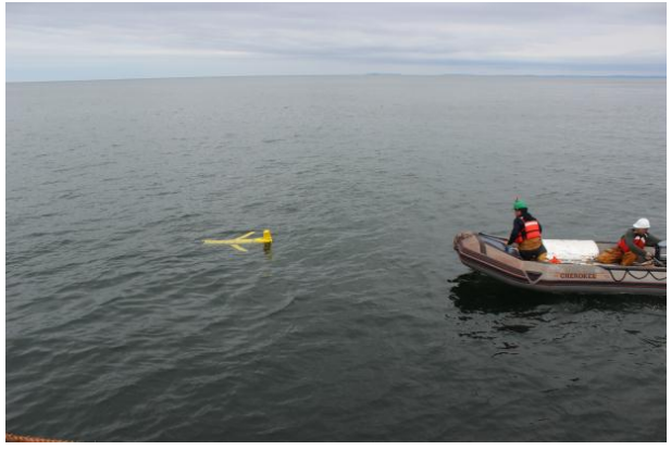
Deploying one of the two Slocum Gliders

science mission provided by the Canadian Centre for Ocean Gliders. These ocean gliders look like bright yellow torpedoes. They carry a suite of science instruments.