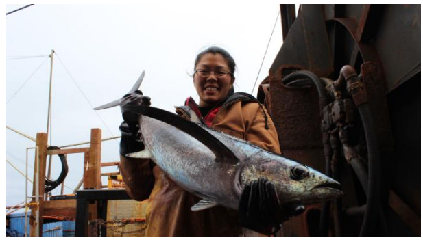
Albacore tuna arrived at the bloom.

Tuna have arrived at the bloom and prowl the edge, first to arrive are the "scouts" in small packs then later the "schoolies" arrive in large schools. They make feeding forays in the bloom; filling their stomachs full of plankton and tiny fish.