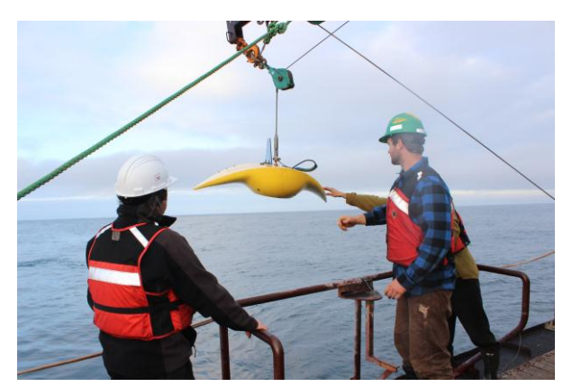
Botwing multi-frequency biomass sonar being deployed separated from the MOCNESS for a transect of the bloom

For the first time ever, 'Nessy' carries a highly sophisticated multi-frequency biomass sonar that records 3D sonar movies of the incredible scene below the waves and the plankton as they are captured in the nets. Positioned from masthead to keel are additional instruments that continuously measure ocean and atmospheric characteristics including logging the content of gases such as Oxygen and CO2.