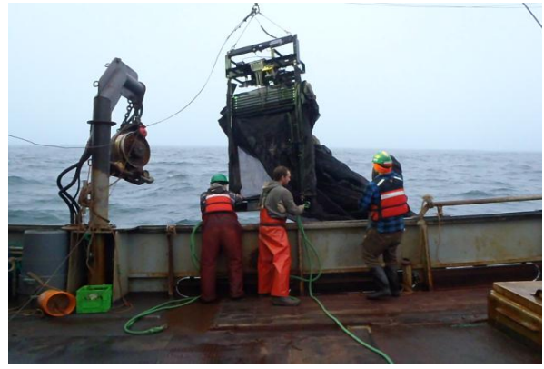
MOCNESS multiple net plankton collection device

Next come the nets to capture and facilitate the study of everything from the tiniest microscopic phytoplankton to the larger zooplankton and micro-nekton (tiny fish). The net samples the team collects, records, and preserves will sustain work for months to come to unravel the mysteries of the life that is now flourishing in the bloom. The Queen of the nets is the MOCNESS, a seven net monster which is towed by the ship. It carries, like barnacles on its back, a fleet of ocean instruments.