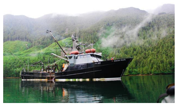
Ocean Pearl at anchor on the west coast of Haida Gwaii

Surely only a tiny fraction of the whales that are here are being seen from the ship. Frequently the whales swim to within a few meters of the ship as if they wonder who is so noisily engaged on their ocean pasture. As the ship returned to shore it found great whales again in similar numbers in a natural plankton bloom in the shallow near shore waters of Queen Charlotte Sound.