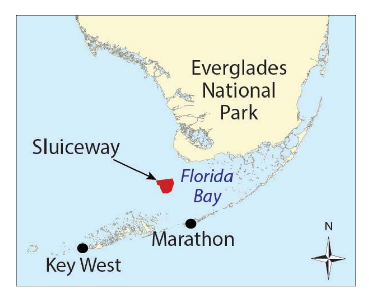
Figure 2. Map of sluiceway and back country (Florida Bay).

Trends in nutrient and chlorophyll-a concentrations, likely indicators of eutrophication (Boyer et al. , 2009), are less clear. Chlorophyll-a had no significant increases and, in fact, had significant decreases in many areas of the Florida Keys, particularly on the oceanside. However, total phosphorus, the limiting nutrient to phytoplankton in some adjacent systems (Fourqurean et al. , 1993; Boyer et al. , 1997), was increasing in most of the Florida Keys, and dissolved inorganic nitrogen, another potentially limiting nutrient (Lapointe, 1997), had no net clear trend as NO<sub>3</sub>